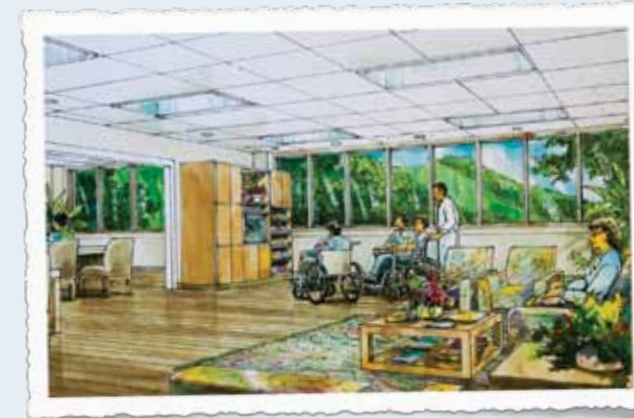
FAMILY ACTIVITY ROOM

HEALING GARDEN for patients and their families to relax. A mobility track will be specifically designed for patients to practice moving across different surfaces when in wheelchairs or fitted with new prosthetics and other adaptive equipment.